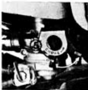
(5) Choke lever