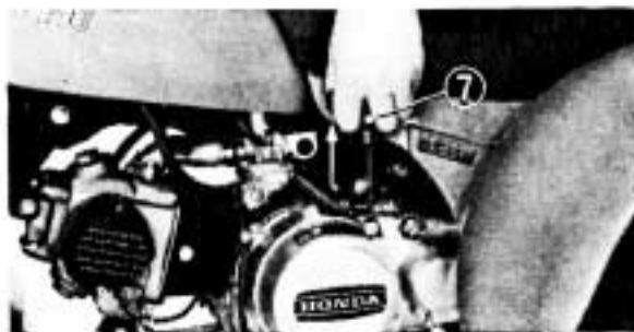
(7) Recoil starter rope