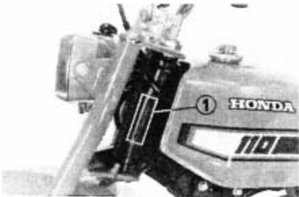
(1) Frame serial number

The frame serial number (1) is stamped on the left of the steering head. The engine serial number (2) is stamped on the crankcase just above the left foot peg.