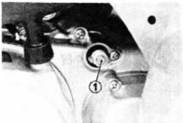
(1) Neutral indicator

The indicator rotates as the gears are changed. When the indicator aligns with the "N" mark on the crankcase, the transmission is in neutral.