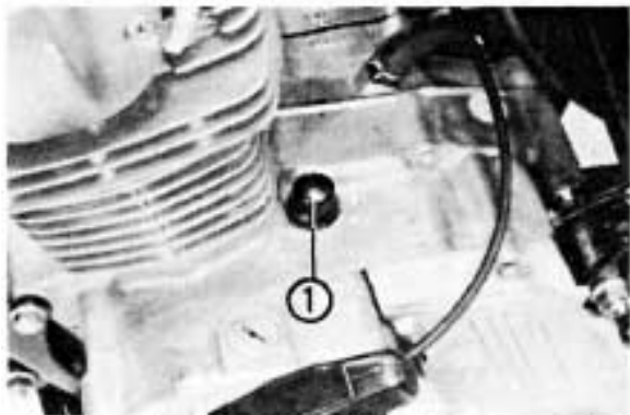
(1) Rubber cap