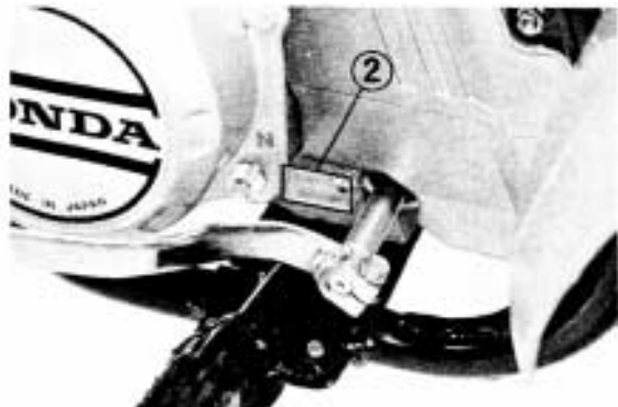
(2) Engine serial number