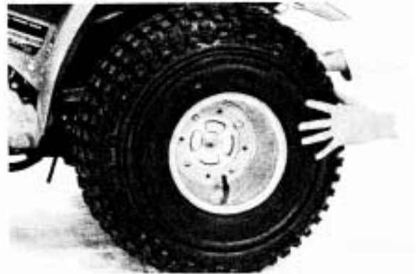
(1) Wheel nuts