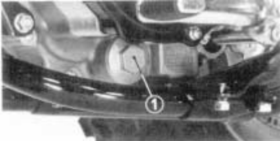
(1) Drain plug