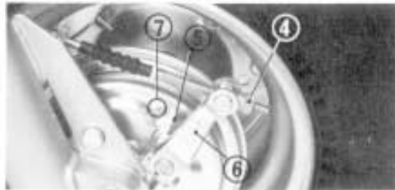
(4) Adjusting nut (5) Arrow (6) Brake arm (7) Reference mark

If the arrow aligns with the reference mark on full application of the brake, the brake shoes must be replaced.