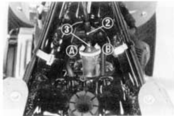
(2) Rubber sleeve (3) Cable adjuster

The cable adjuster (3) is located on top of the carburetor. Slide the rubber sleeve (2) back to expose the throttle cable adjuster (3). Turn the adjuster to obtain the correct free play. Reinstall the sleeve after adjustment.