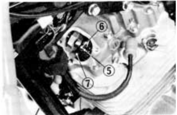
(5) Lock nut (7) Feeler gauge (6) Adjusting screw