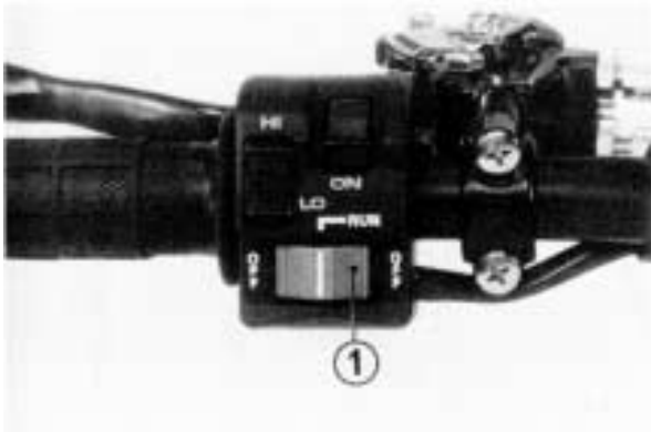
(1) Ignition switch

The three position ignition switch (1) is under the headlight switch. At RUN, the engine will operate. In either OFF position the engine will not operate.