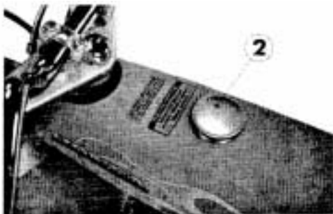
② Fuel tank cap

The fuel tank cap ② is removed by turning it counterclockwise. The fuel tank capacity including reserve fuel is 2.5 l (0.6 U.S. gal.). Use of low lead gasoline having a 91 octane rating or higher is recommended. If such gasoline is not available, use a leaded regular grade gasoline. Do not use a gasoline-oil mixture.