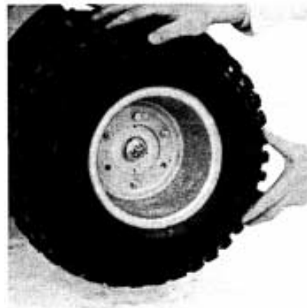
① Wheel nuts