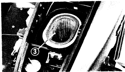
3 Air cleaner element

Loosen the grip play adjuster lock nut 1 and turn the adjuster in either direction to obtain the grip free play rotation of 10~15°. Retighten the lock nut.