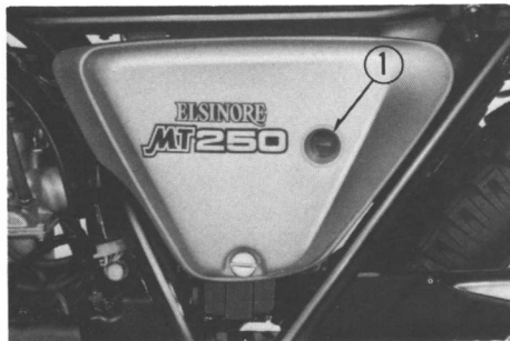
① Inspection window

The oil tank is located at the left center of an motorcycle. Place the motorcycle in the upright position, and check oil level at the inspection window ①.