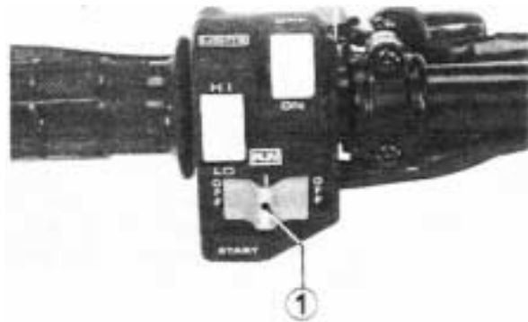
(1) Engine stop switch