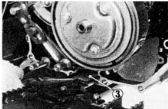
(5) Oil filter screen