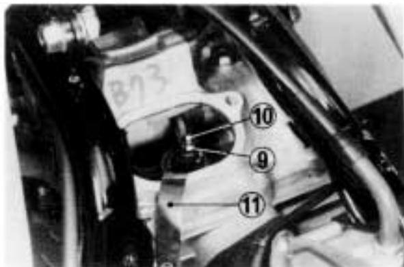
(9) Lock nut (11) Feeler gauge (10) Adjusting screw