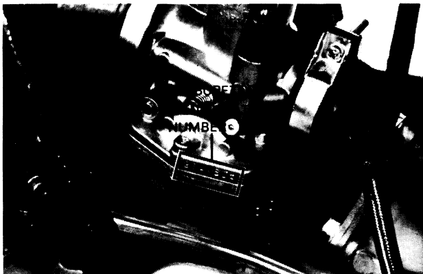
The carburetor identification number is on the carburetor body right side.