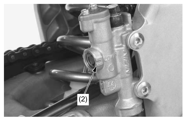
(2) LOWER level mark

With the motorcycle in an upright position, check the fluid level.