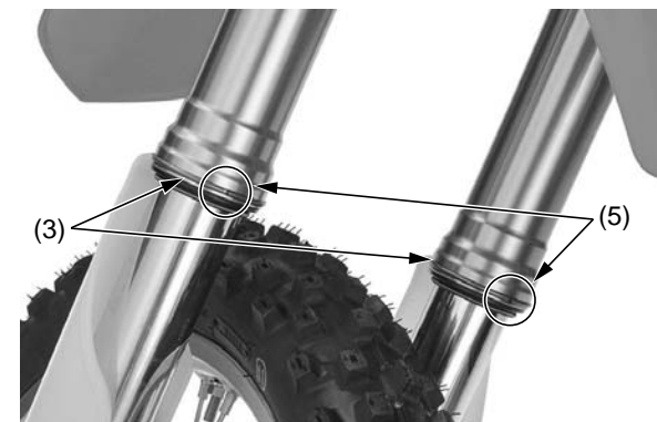
(3) wear rings (5) end gaps