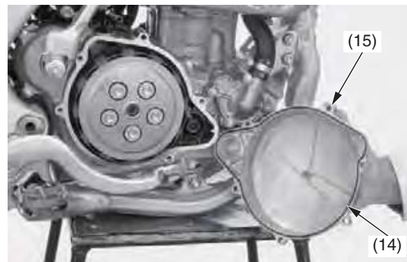
(14) O-ring (new) (15) clutch cover