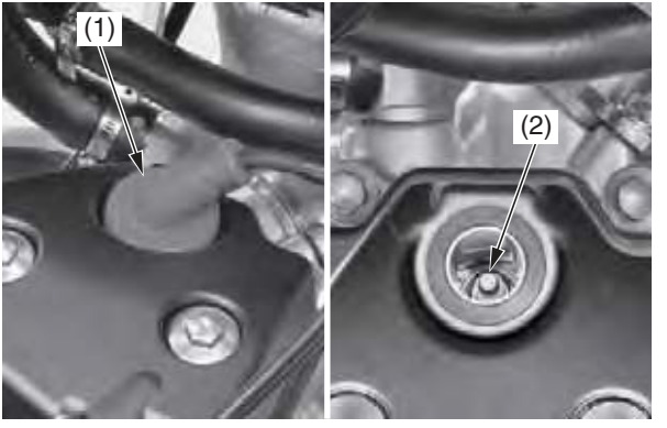
(1) spark plug cap