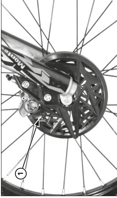
(1) BRAKE DISC

If either pad is worn, both pads must be replaced.