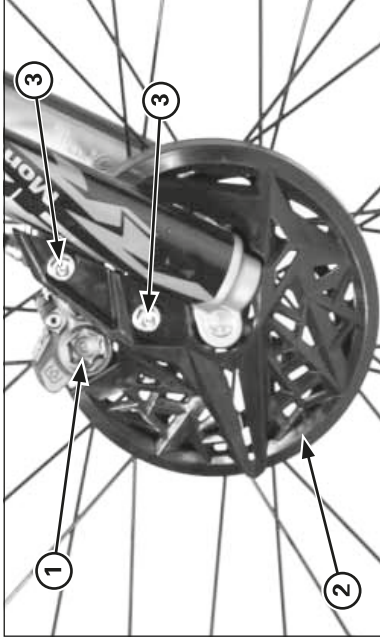
(1) BRAKE CALIPER (2) DISC COVER (3) BOLTS

Install the brake caliper, flange collars and disc cover. Apply a locking agent to the threads and tighten the mounting bolts to the specified torque.