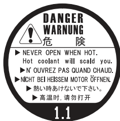
1.1 radiator cap danger